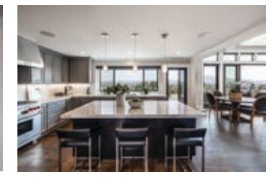
3258 Surmont Drive, Lafayette 5 Bed | 3.5 Bath | 3,443 Square Feet | .82 Acre